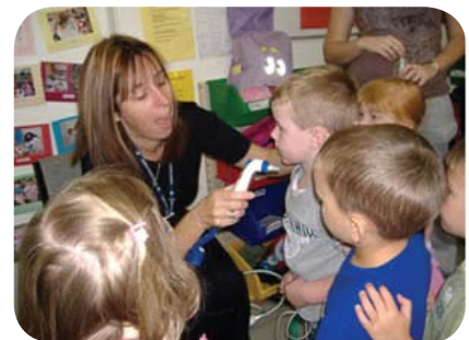
The Community Health Awareness Program includes all ages

"The Wellbeing and Balance Program has made a real difference to the staff at Kareena and the community program has also been immensely popular with the recent SIDS and Kids events totally booked out."